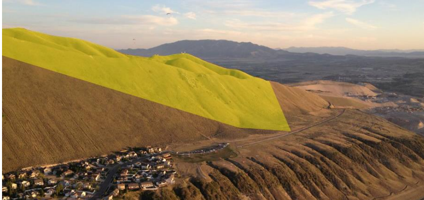
The yellow area and hills behind the mountain in this picture is the proposed area

Geneva Rock wants to expand mining of the mountain and hills behind for the next 50 years! This expansion will more than double their present size!